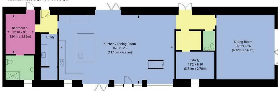
Ground Floor GROSS INTERNAL FLOOR AREA APPROX. 1848 SQ FT / 171.71 SQ M

NOT TO SCALE - FOR ILLUSTRATIVE PURPOSES ONLY APPROXIMATE GROSS INTERNAL FLOOR AREA 3357 SQ FT / 311.89 SQ M - (Excluding Voids) All measurements and fixtures including doors and windows are approximate and should be independently verified. www.exposurepropertymarketing.com © 2024